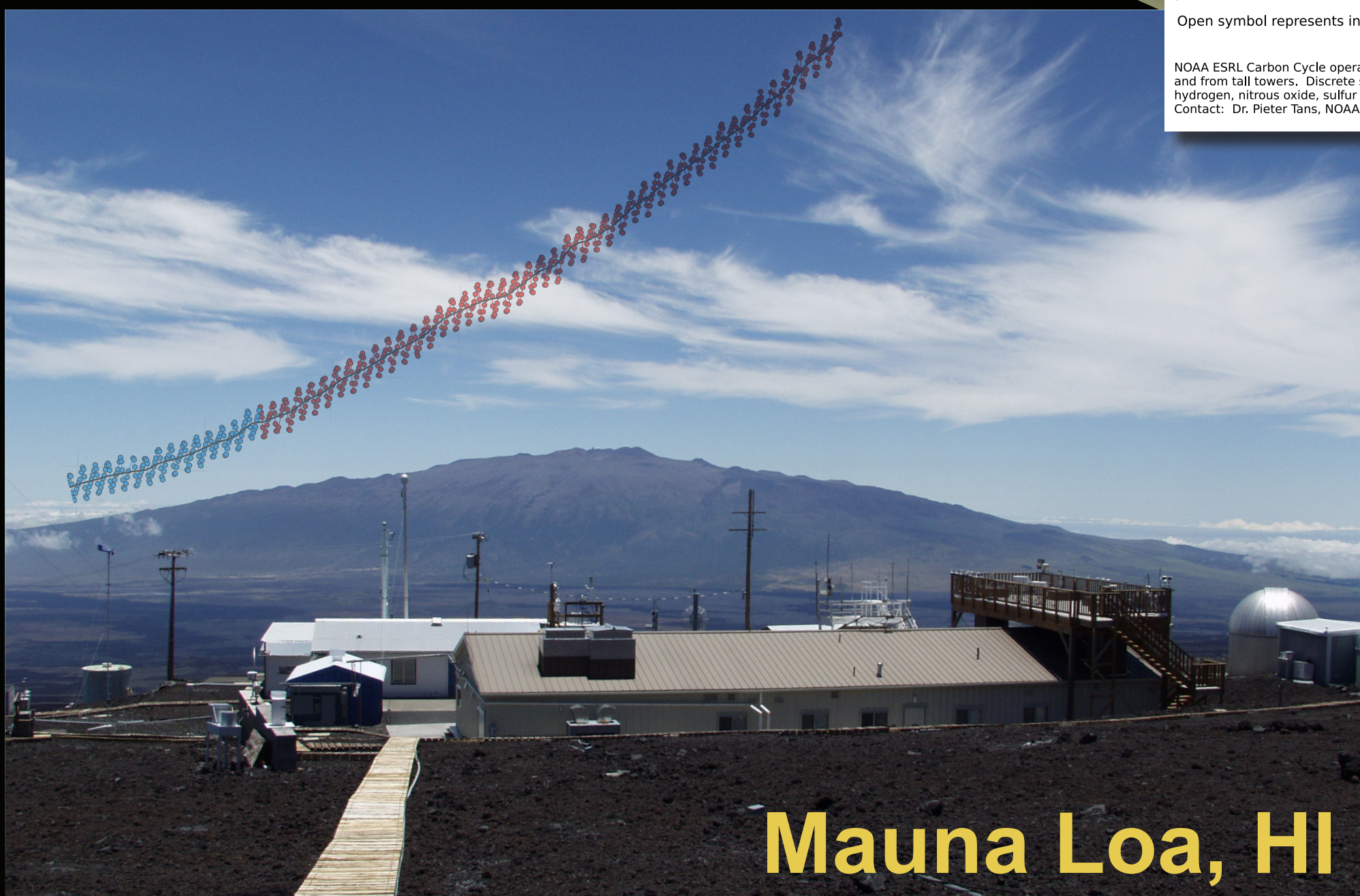
Mauna Loa, HI

On 3 June 2008, U.S. Senator Olympia J. Snowe (Republican-Maine) presented this poster on the Senate floor and entered the IPCC 4th Assessment authors from NOAA into the Congressional Record during discussion of the Climate Security Act of 2008.