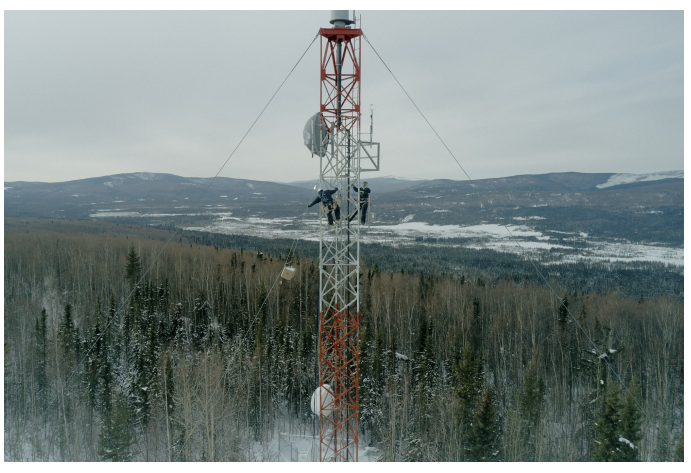
Figure 2. Tower crew installs DCS laser transceivers overlooking Goldstream Valley.