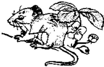
Merriam pocket mouse