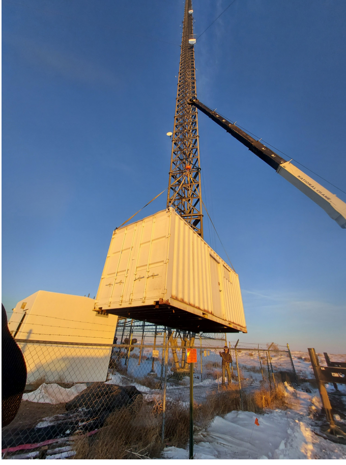
Figure 2. Figure 2. Installing the site container to house instruments and equipment