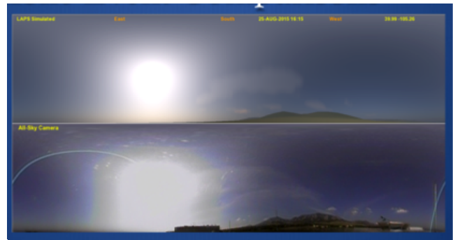
Figure 2. 25 Aug 2015 (right, AOD=0.23).